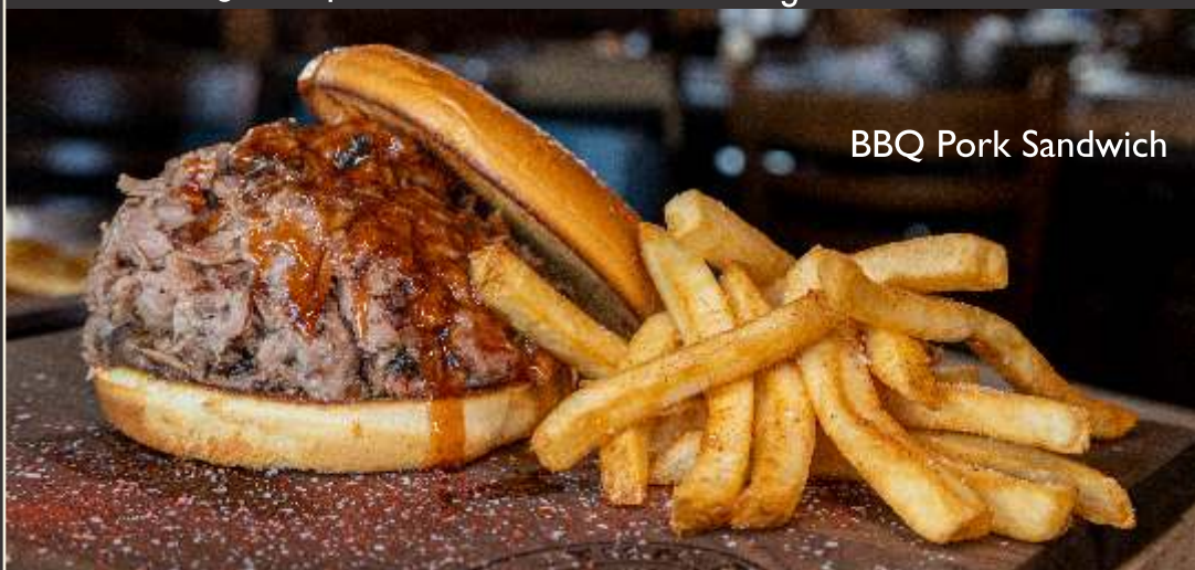
BBQ Pork Sandwich

Fresh cooked corn beef brisket, sliced to perfection, served on grilled marble rye bread with sauerkraut, swiss cheese, pickle and Thousand Island dressing.