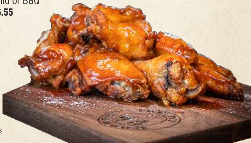
Buffalo Chicken Wings

A pound of spicy chicken wings with blue cheese dressing. Just dip and eat! Hot, Mild or BBQ Half $9.99 Full $16.55